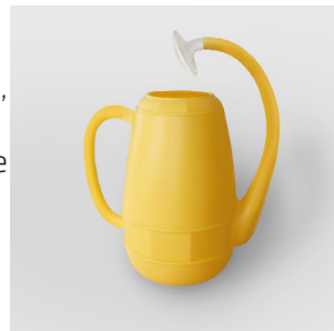
Art: Clark Kellogg

There is a strong emphasis on collaboration, peer-to-peer critique and developing creative confidence in risk taking (similar to Clark's other creativity-based courses). Projects will have work plans with milestones and deliverables. They will be graded on all three phases of work, weighted to the final project public gallery. Craft and quality are essential. Prior art training is not.