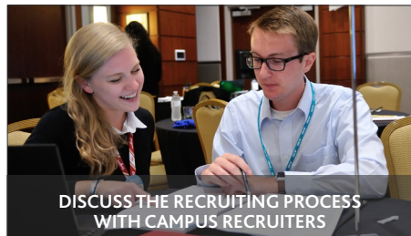
DISCUSS THE RECRUITING PROCESS WITH CAMPUS RECRUITERS