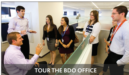
TOUR THE BDO OFFICE