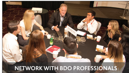
NETWORK WITH BDO PROFESSIONALS