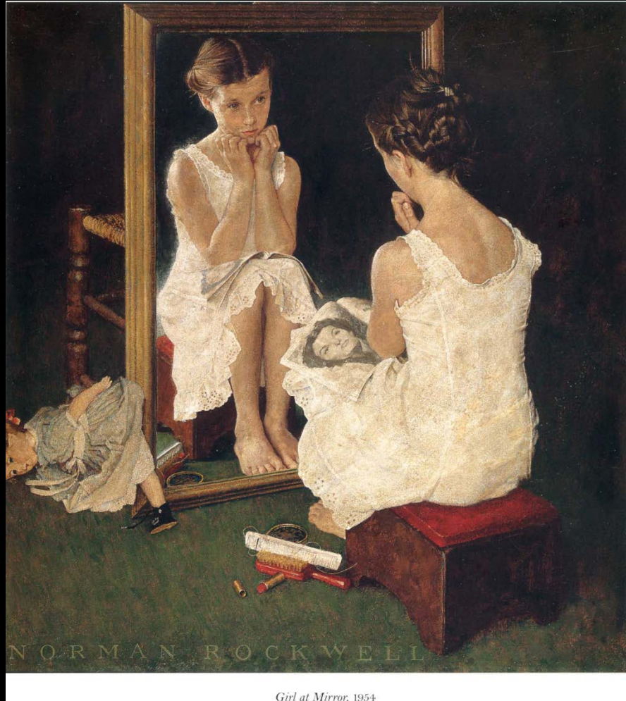
Girl at Mirror, 1954