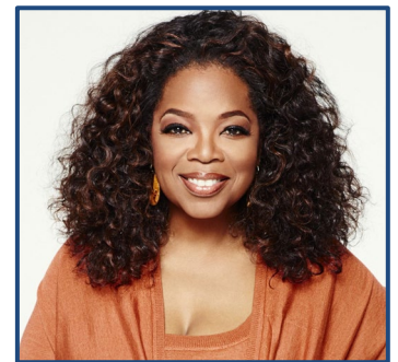
Oprah Winfrey CEO of Harpo, Inc.

A: They all understand, focus on, and care about the financial reporting and financial health of their companies and investments.