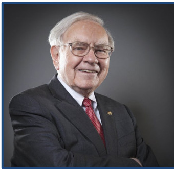
Warren Buffett CEO of Berkshire Hathaway

Q: What is the common denominator of these business titans?