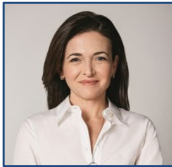
Sheryl Sandberg COO of Facebook